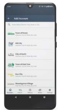
Now available for Android