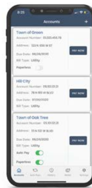
Updated iPhone version